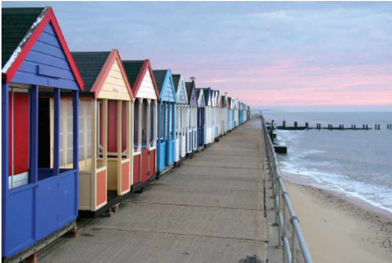
Colourful beach huts.