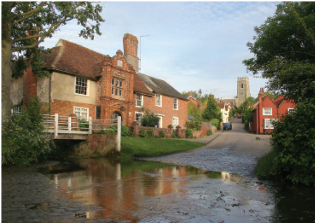
Nestling in the Brett valley with its lovely timbered buildings and quaint ford, Kersey is a fine example of a Suffolk community that benefited greatly from wool wealth.