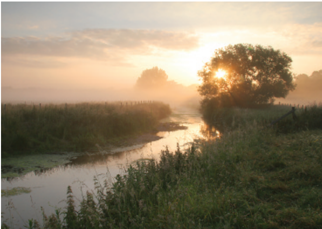
Above: The River Stour meanders quietly along the Essex/ Suffolk border.